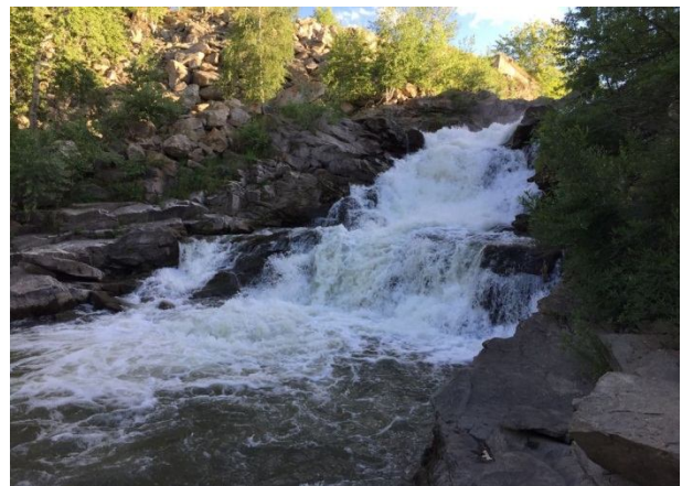
Rare-metal pegmatites of Kalba (village Asu-Bulak)