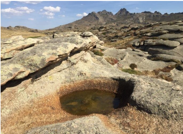
Natural boundary Ayr