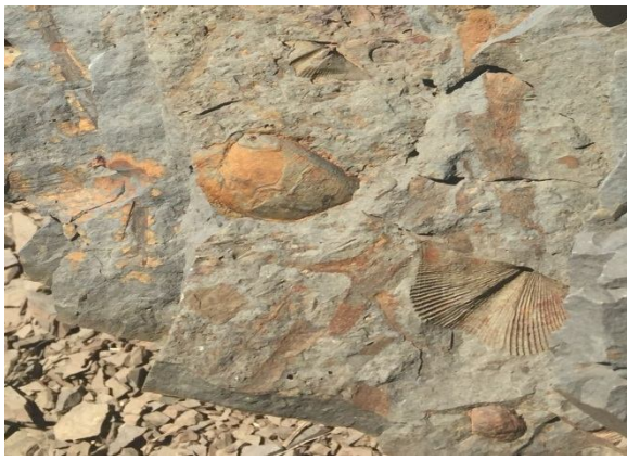
Tarhan geological incision